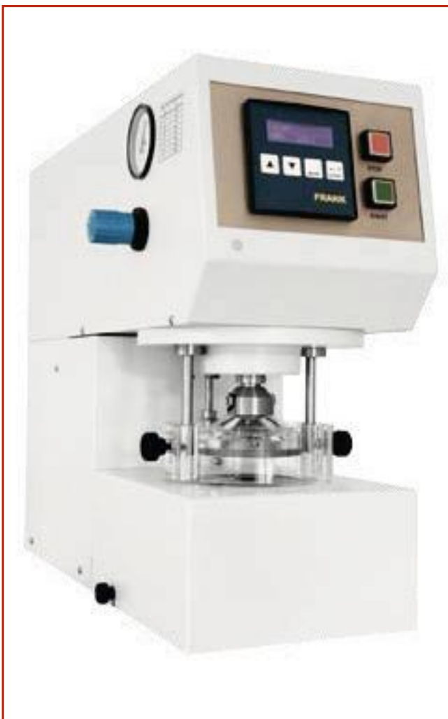
F18532: burst digital for paper